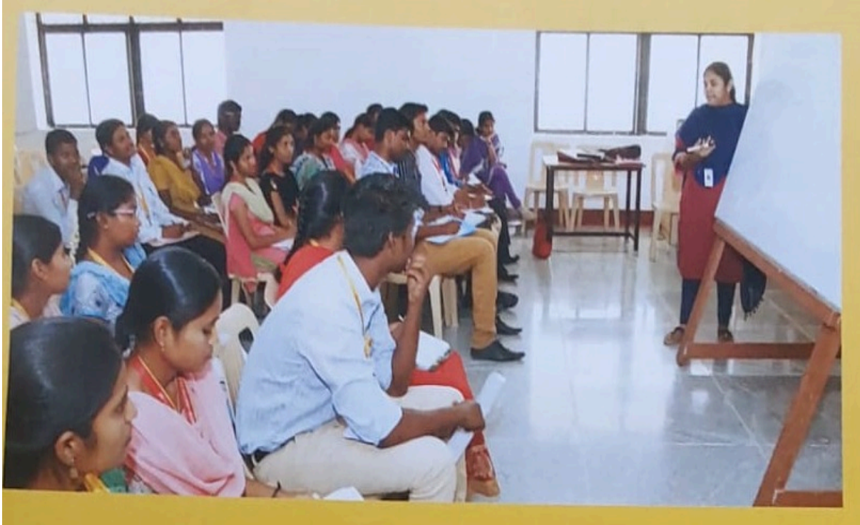
Students attending aptitude training session