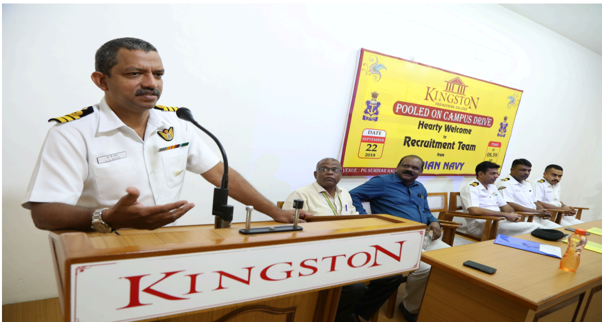
Indian Navy – Visited our campus for hiring Engineers under UES Scheme (University Entry Scheme)